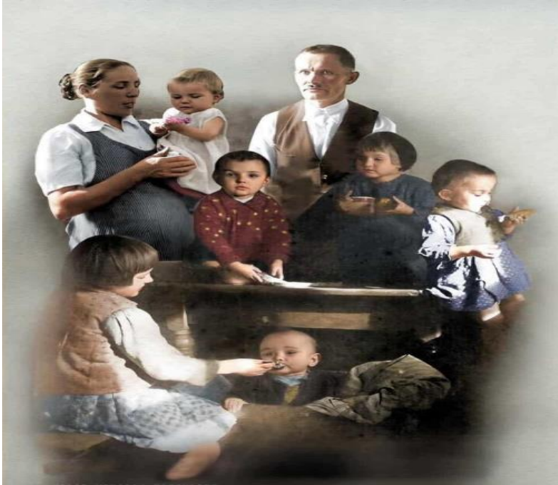
Official picture of the Beatified Family