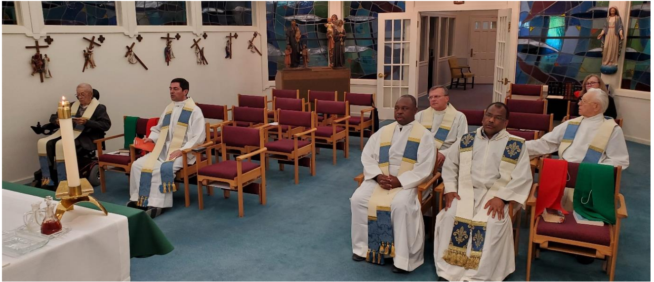
Guests from our Curia in Rome, Italy at the Manchester House on October 23, 2023